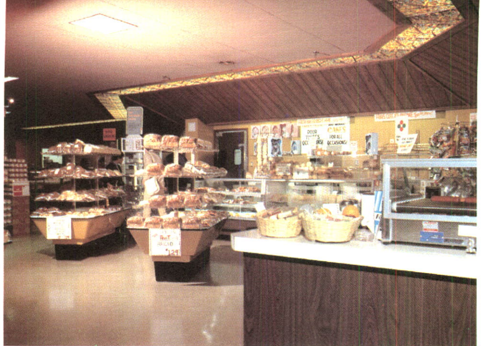
An instore bakery - ready for opening