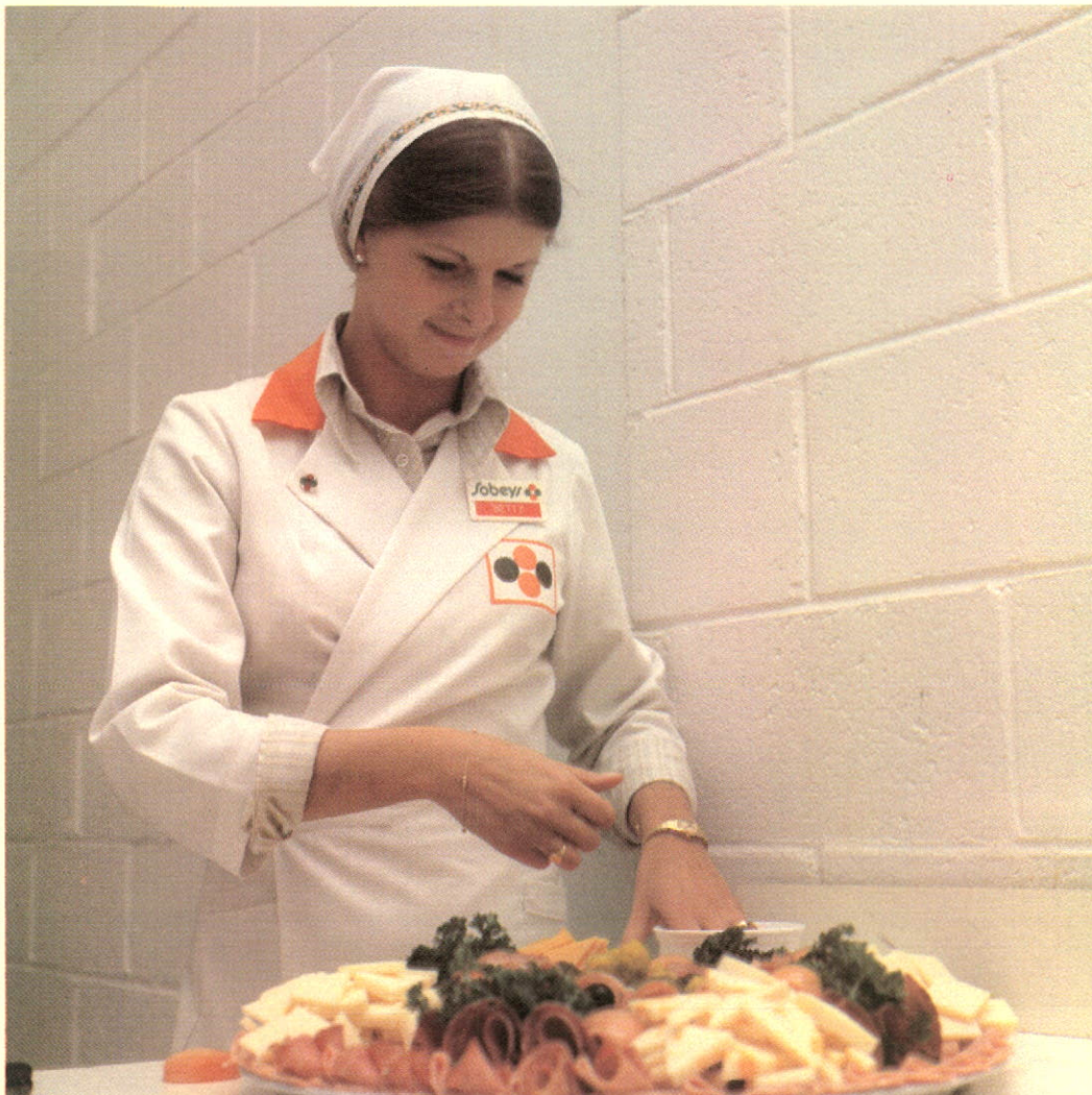
Meat and cheese trays from our Deli - careful attention to every detail