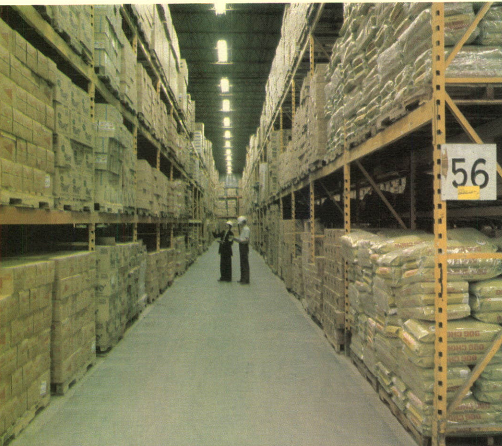
Part of over 200,000 cases of grocery inventory at the Stellarton Distribution Centre

During the year additional shares in Provigo Inc. were acquired increasing this holding to approximately 24% of that company. Provigo Inc., a Quebec based company is engaged primarily in the wholesale and retail distribution of food, pharmaceuticals and general merchandise throughout Canada and parts of the United States. In its 1980 fiscal year, the net income of Provigo was $18 million on sales of $2.3 billion. This investment is accounted for on the "cost" basis whereby only cash dividends received are included in income.