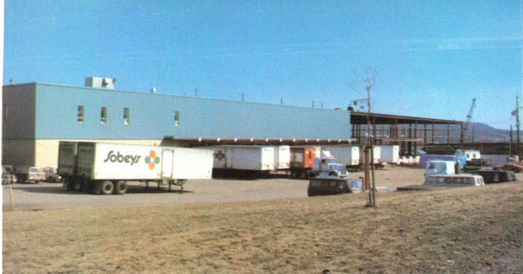
Stellarton Distribution Centre - under expansion