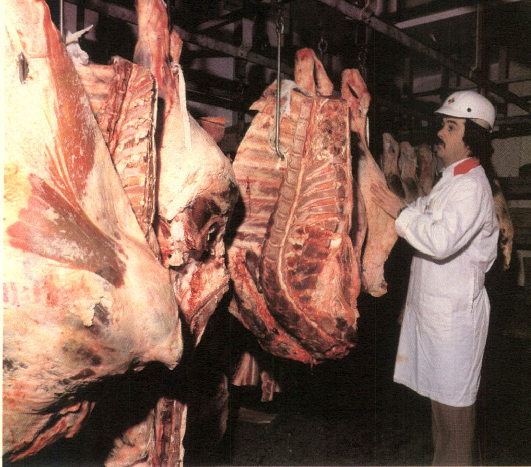
Canada Grade A beef - Sobeys meat "A cut above the Rest"

The Company remains committed to a policy of expanding market position through its planned program of expansion, modernization and new construction.