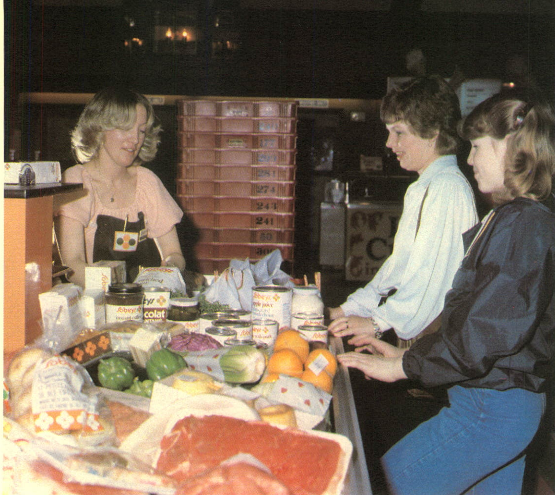
Sobeys - your place for food