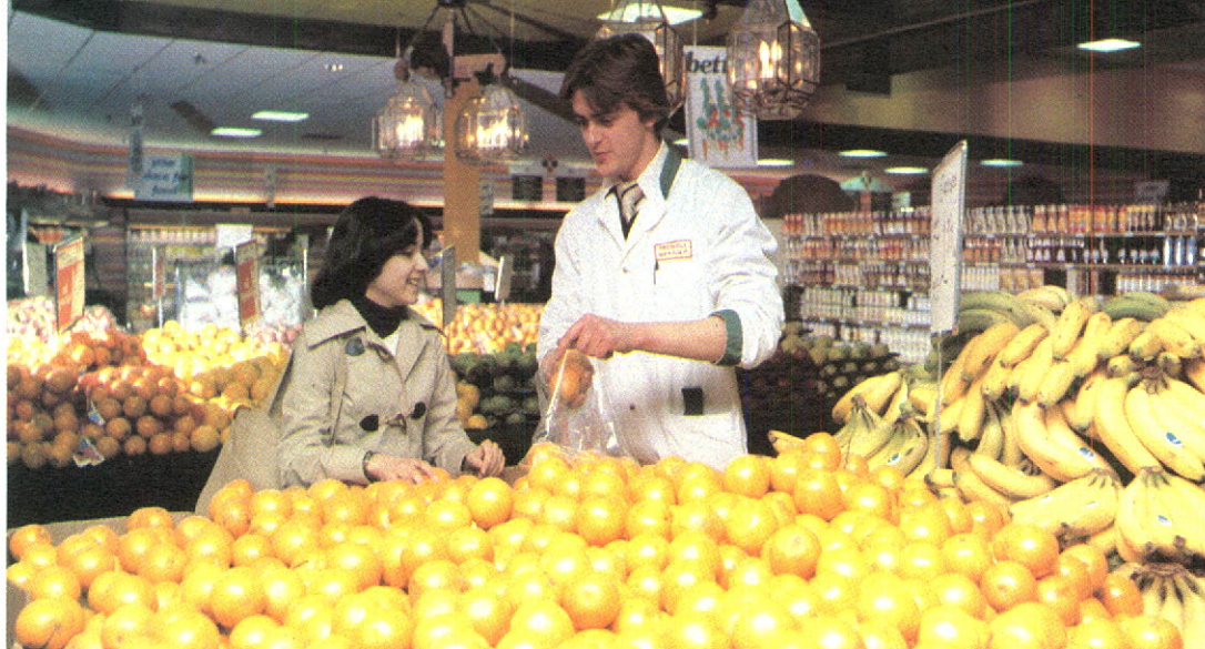
Personal service - attending to customer needs