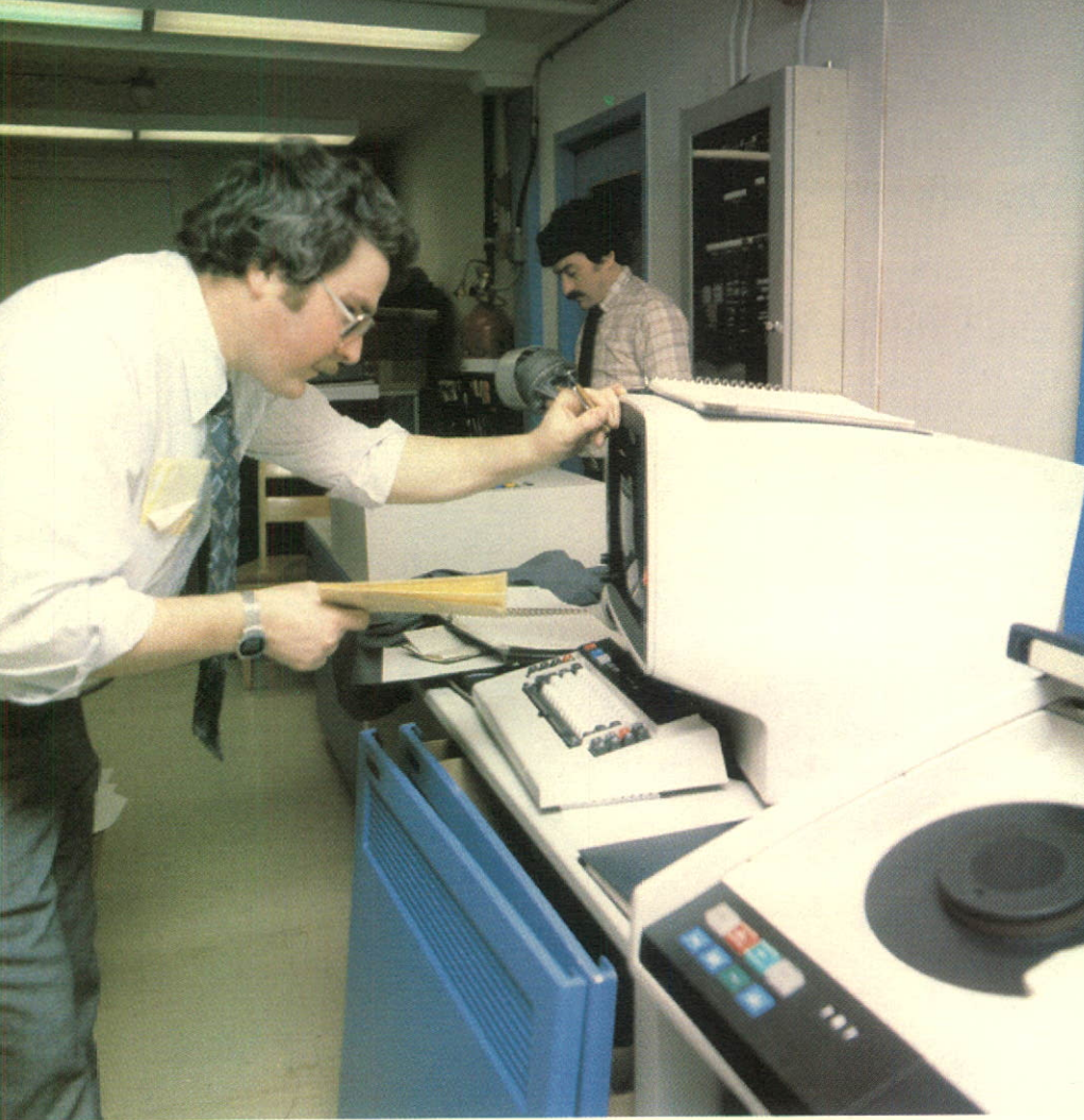
Installation proceeds on the new 4331 Computer System in Stellarton