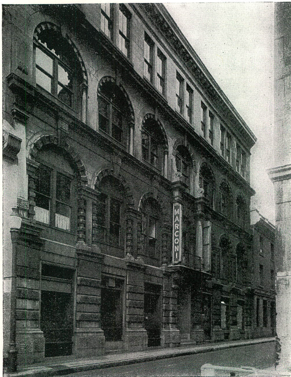
MARCONI BUILDING MONTREAL