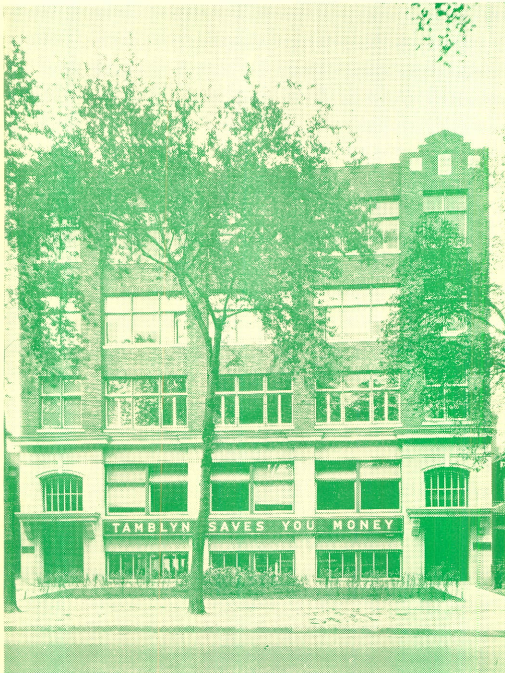
G. TAMBLIN, LIMITED Administration Offices and Laboratory situated at 227 Jarvis Street, Toronto