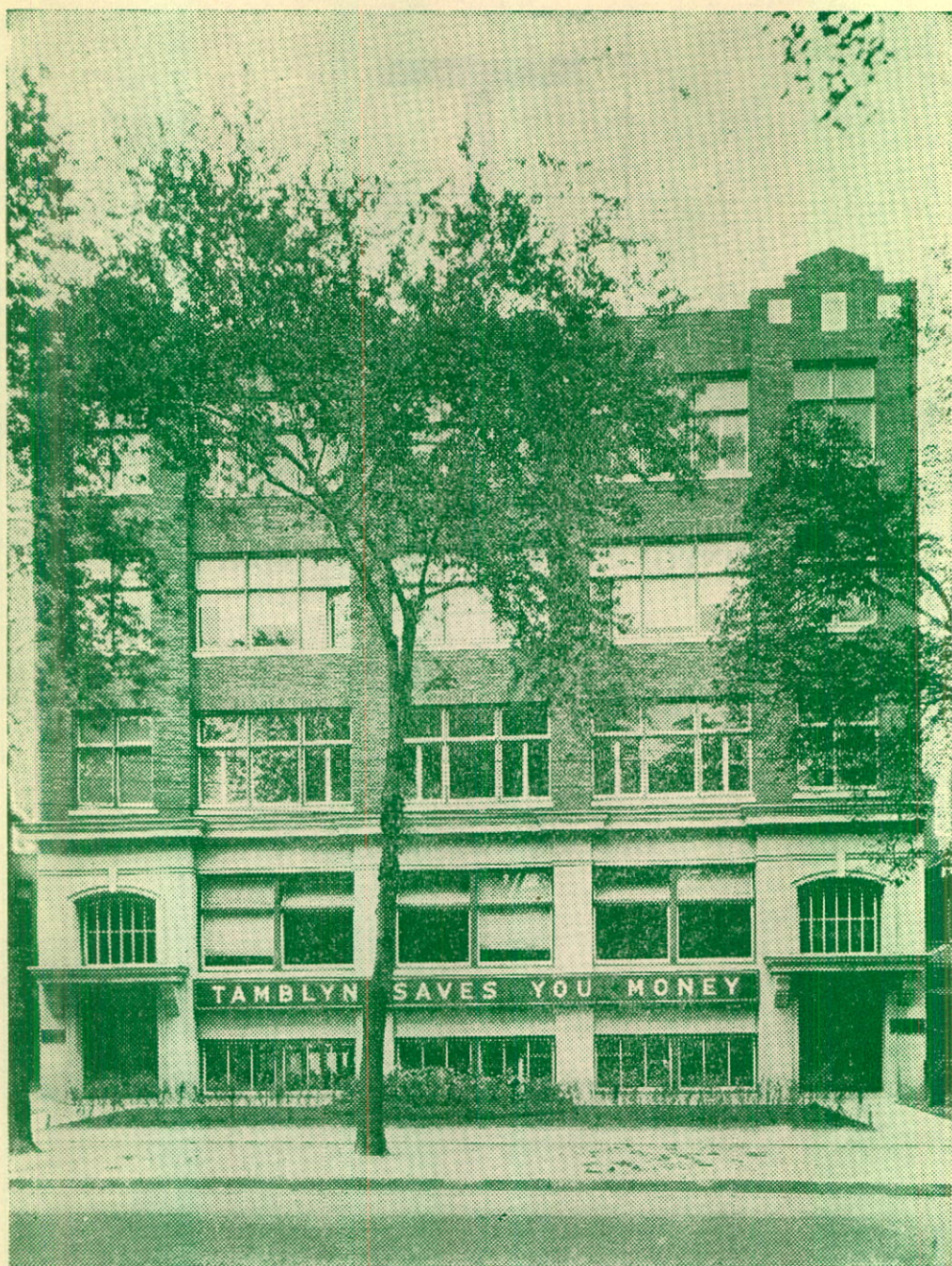
G. TAMBLYN, LIMITED Administration Offices and Laboratory situated at 225 Jarvis Street, Toronto