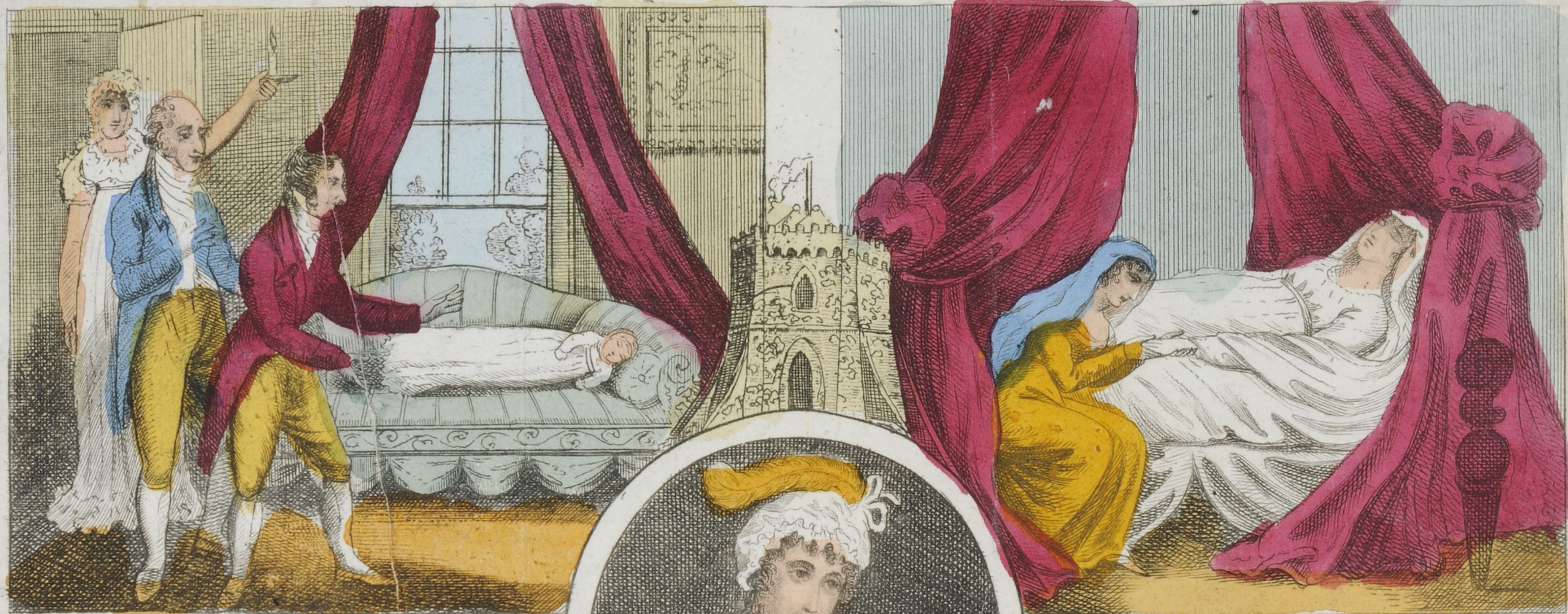
The deserted Infant Agnes St Eustace, discover'd by M r Irwin