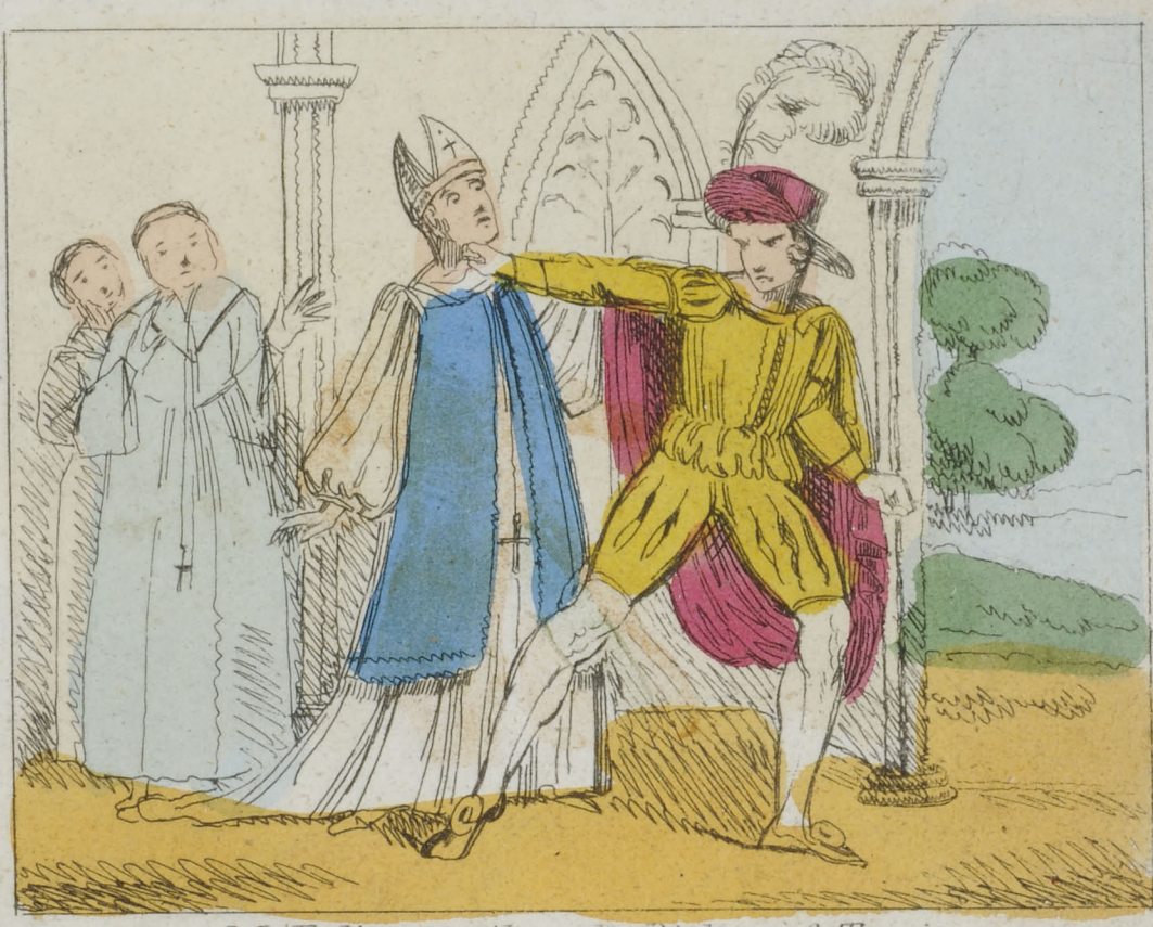
M. Faliero strikes the Bishop of Treviso.