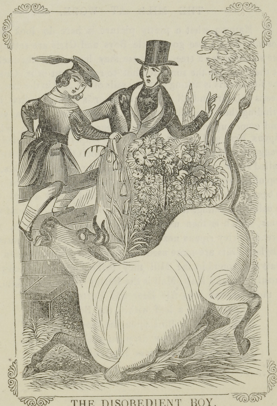
THE DISOBEDIENT BOY.