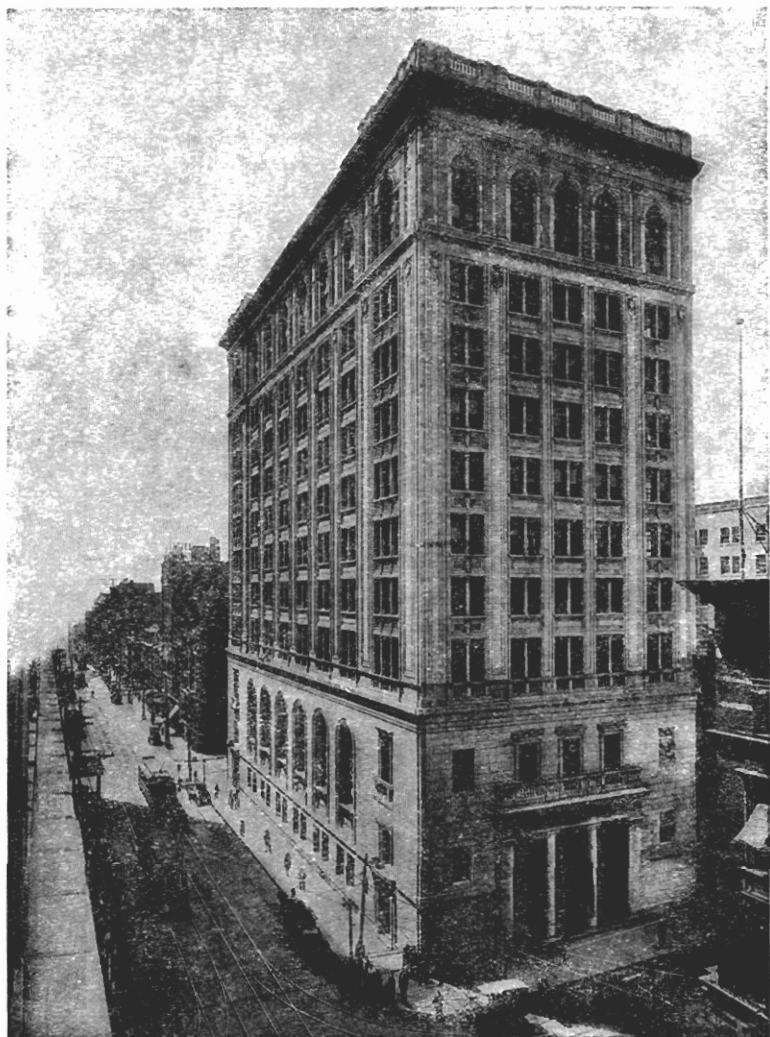
HEAD OFFICE KING AND YONGE STREETS TORONTO