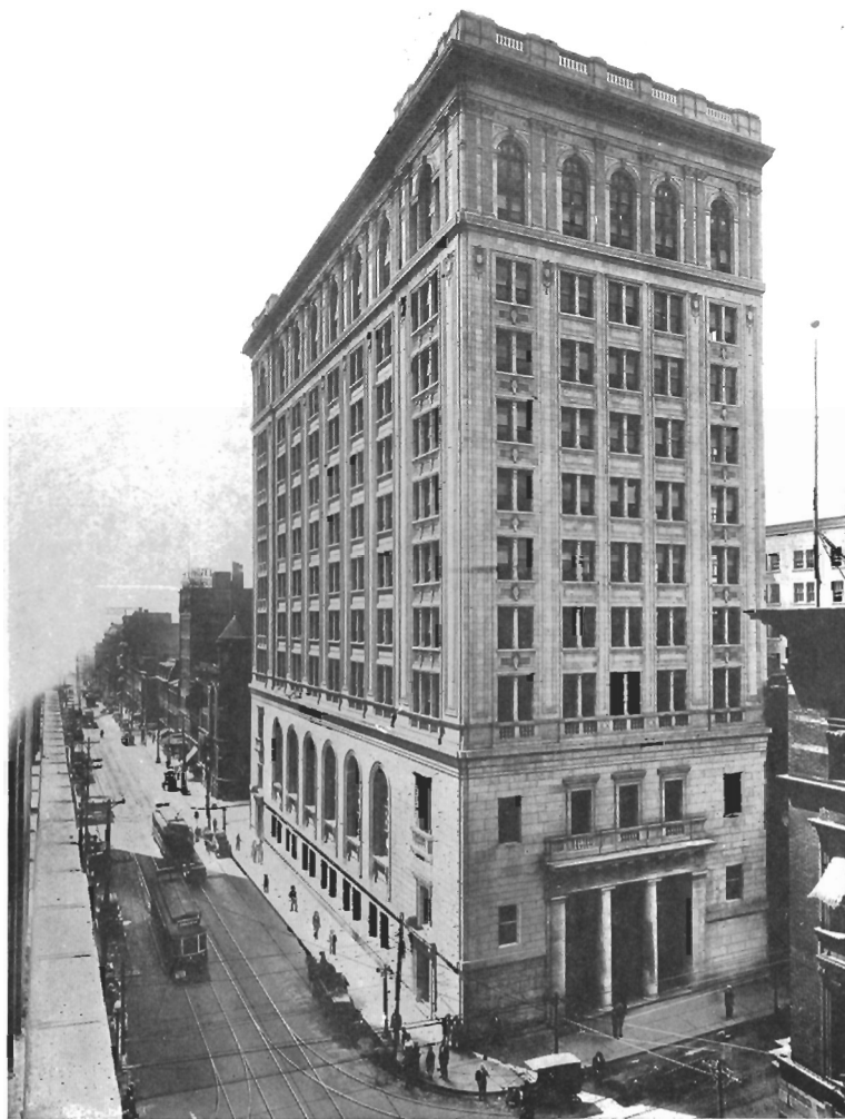
HEAD OFFICE BUILDING TORONTO, CANADA ERECTED 1914.