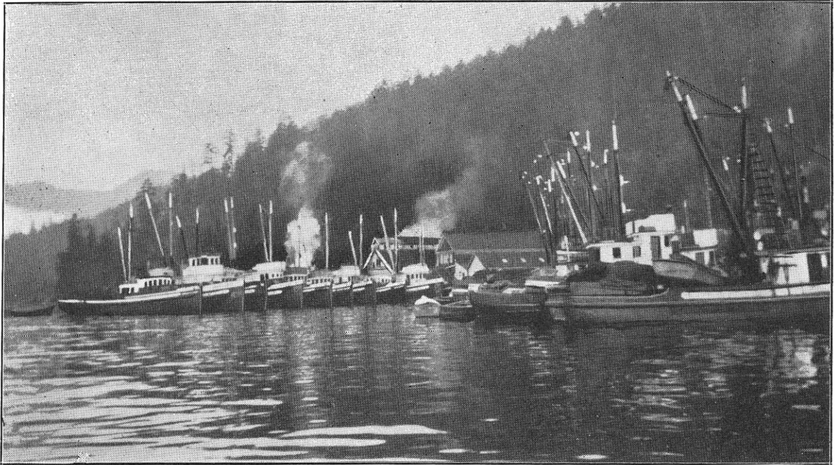
The West Coast of Vancouver Island Herring Fleet tied up at our Kildonan Plant in Barkley Sound, B.C.

T HE above picture includes several boats of the fleet of the British Columbia Packers Limited, which consists of ■ steamboat 115 feet long, 13 power boats over 70 feet long, 29 power boats between 50 and 70 feet long, 161 other smaller powered fishing boats, a total of 206.