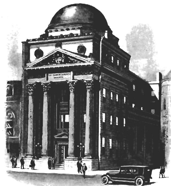
YONGE STREET BRANCH, TORONTO