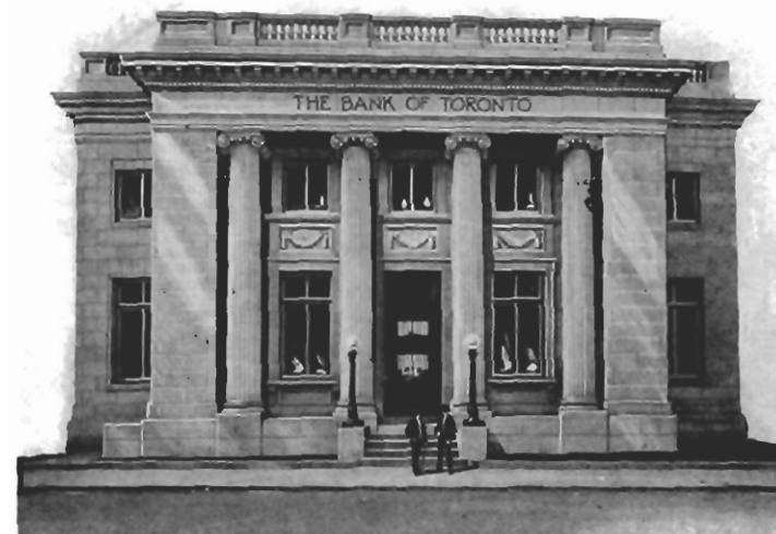
ST. CATHARINES BRANCH