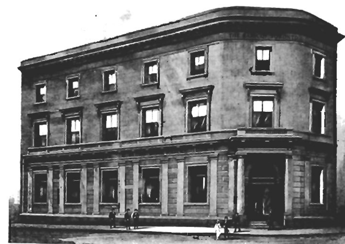
DUNDAS AND KEELE STREETS BRANCH, TORONTO