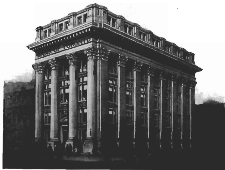
ST. CATHERINE AND GUY STREETS BRANCH, MONTREAL