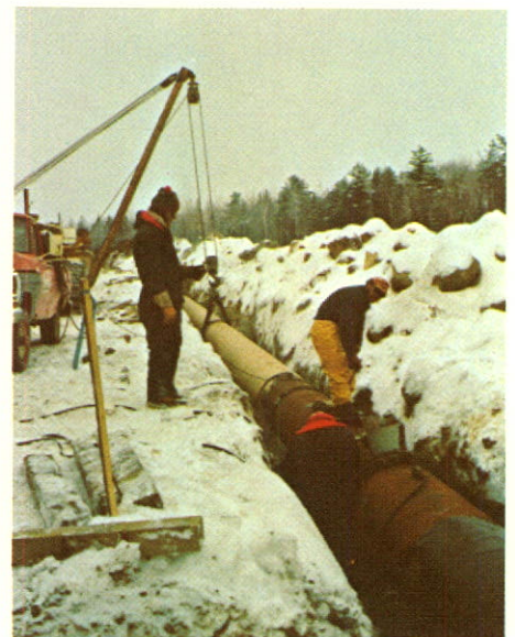
Lowering in 30" pipe under winter conditions.

In the United States, the Federal Energy Administration has classified refineries according to their dependence on Cana-