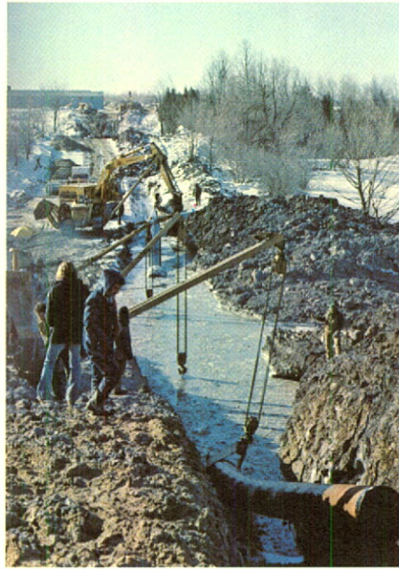
Installation of creek crossing in Quebec.