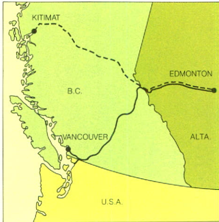
----- Proposed Kitimat Pipe Line Ltd. ——— Trans Mountain Pipe Line Company Ltd.

dian crude, with those most dependent on Canadian crude having first claim on the first 264,000 b/d of exports from Canada. Of the eleven refineries or utilities comprising the Federal Energy Administration's priority, Interprovincial serves seven representing approximately 78% of the declining exports.