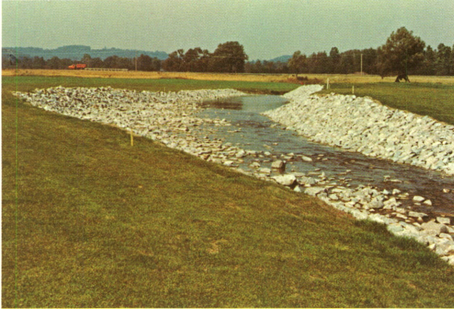
Completed creek crossing in Ontario.

Also planned for 1977 is the replacement of eight old 900 h.p. diesel pumping units at Glenavon, Saskatchewan and Viking, Minnesota with electric pumping units. One 1,500 h.p. electric pumping unit will be installed at Glenavon and two at Viking. The total cost is estimated to be $2.3 million.