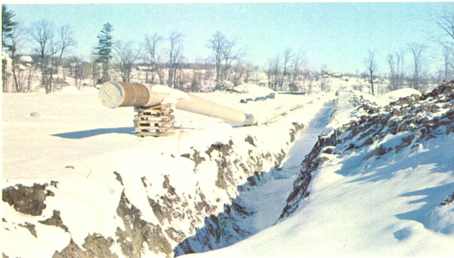
Ditching parallel to TransCanada right-of-way in fall of 1975. Right-of-way after a snow storm.

In Canada, property and other taxes were $900,000 higher than in 1975 of which $600,000 resulted from increased mill rates and $260,000 higher provincial capital taxes. Property and other taxes in Lakehead were lower by $800,000 mainly as a result of an over-provision in 1975 for property taxes in Minnesota and Indiana. Depreciation and interest charges were higher by $7.3 million and $11.1 million respectively, largely as a result of the Montreal Extension. Income taxes for 1976 were lower by $2.9 million due to reduced taxable income, expiration of the 10% Canadian Corporate Surtax in April 1975, and a 1% reduction in the Canadian federal tax rate for 1976.