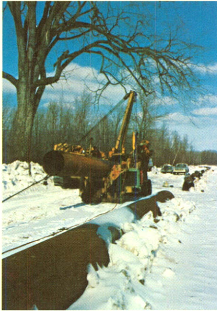
Pipe bending machine.