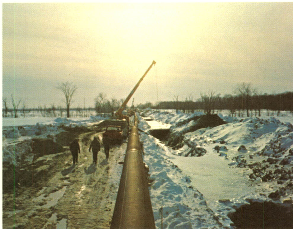
Removing ice and water from ditch.

Montreal, tariffs remained unchanged throughout the year. The rates to Buffalo were increased by 4¢ per barrel.