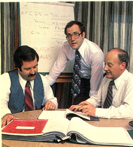
Members of the Fine Papers Division's marketing group planning one of the sales program.