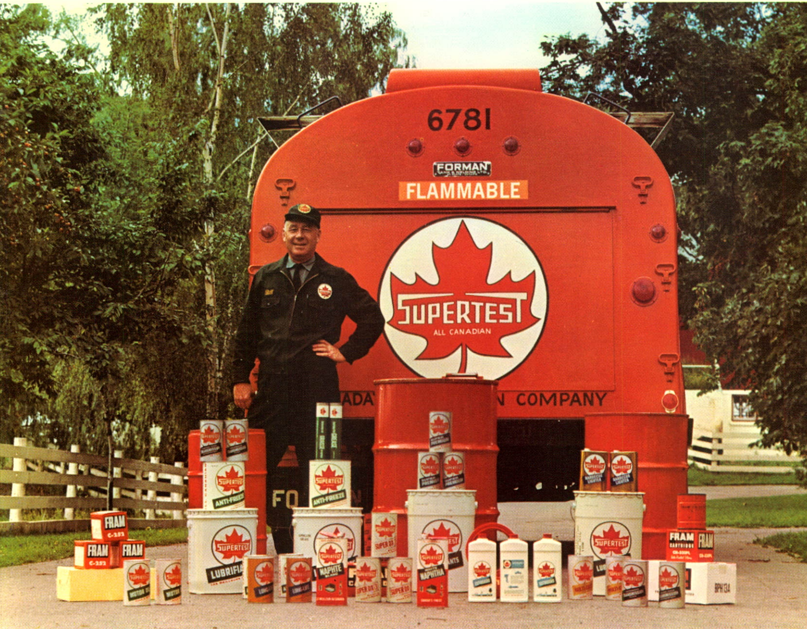
More than 100 farm agents deliver Supertest Petroleum products year round to farms in Ontario and Quebec.