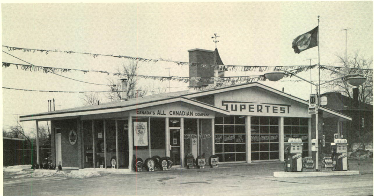
This good looking station is now at the corner of Vaughan Road and Cherrywood in Toronto. It replaces an older Supertest Service Station and can now provide motorists with the finest service and facilities in this area.

encountered in carrying out the service station building program for the year. In most other areas of operation expenses continued to rise as well, not the least of which are the ever-increasing demands of all levels of government. These range from such items as increased postage and motor vehicle license fees to higher business and realty taxes. In view of the many service station properties owned by your company, the rapid and substantial rise in municipal taxes can only be viewed with concern for the future.