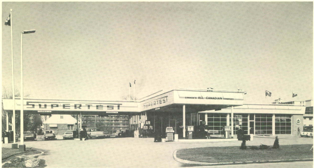
One of Supertest's largest stations was completed at the corner of Adelaide and Huron Streets in London. The service area has most types of diagnostic and alignment equipment and a complete range of automotive accessories is offered in the merchandise showroom.

The great contribution of experienced and loyal employees, dealers, and agents, has always been a big factor in the development and success of the Company. Some of the employees and agents are seen below at a presentation party held in their honour.