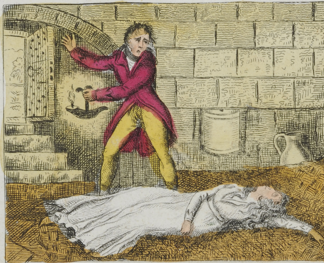
Count Belmire enters the Covern & sets the Dutchefs of C.at liberty.