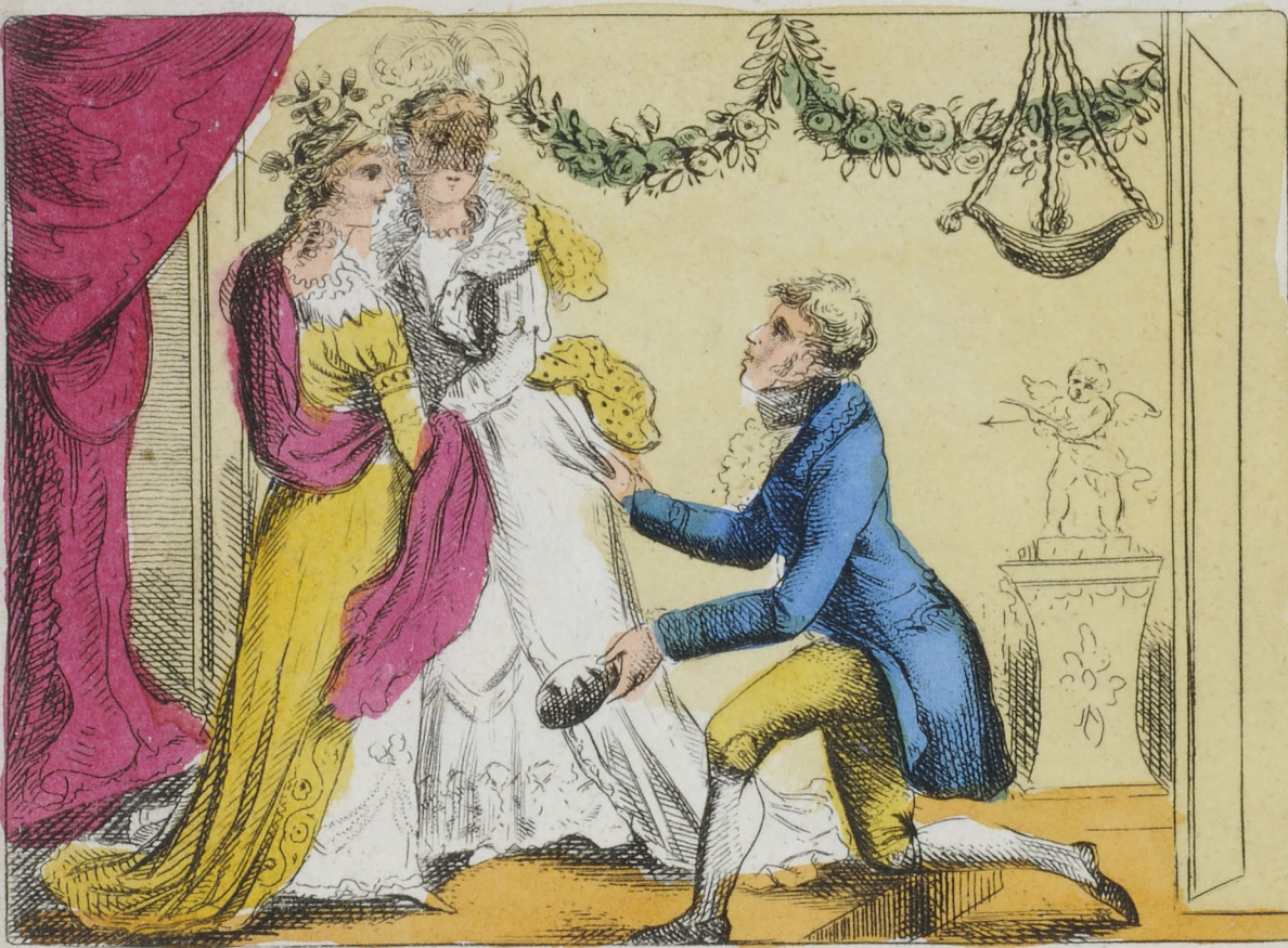
Count of Belmire soliciting an interview with the Dutchef's of C_.