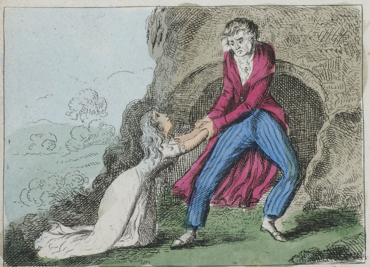
The Duke dragging the Dutchess of C_into a gloomy Cavern.