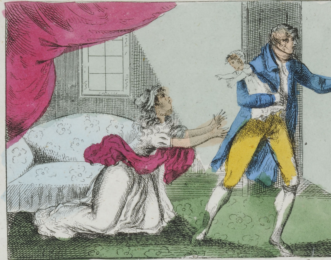
The Dutchefs of C_. entreating her husband to restore her Child.