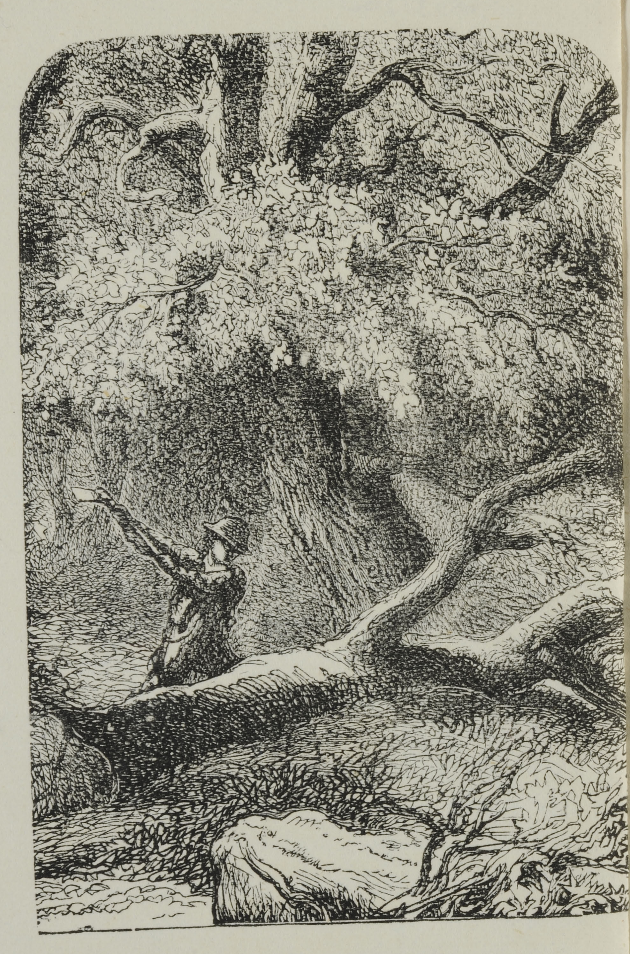
"CUT IT DOWN."